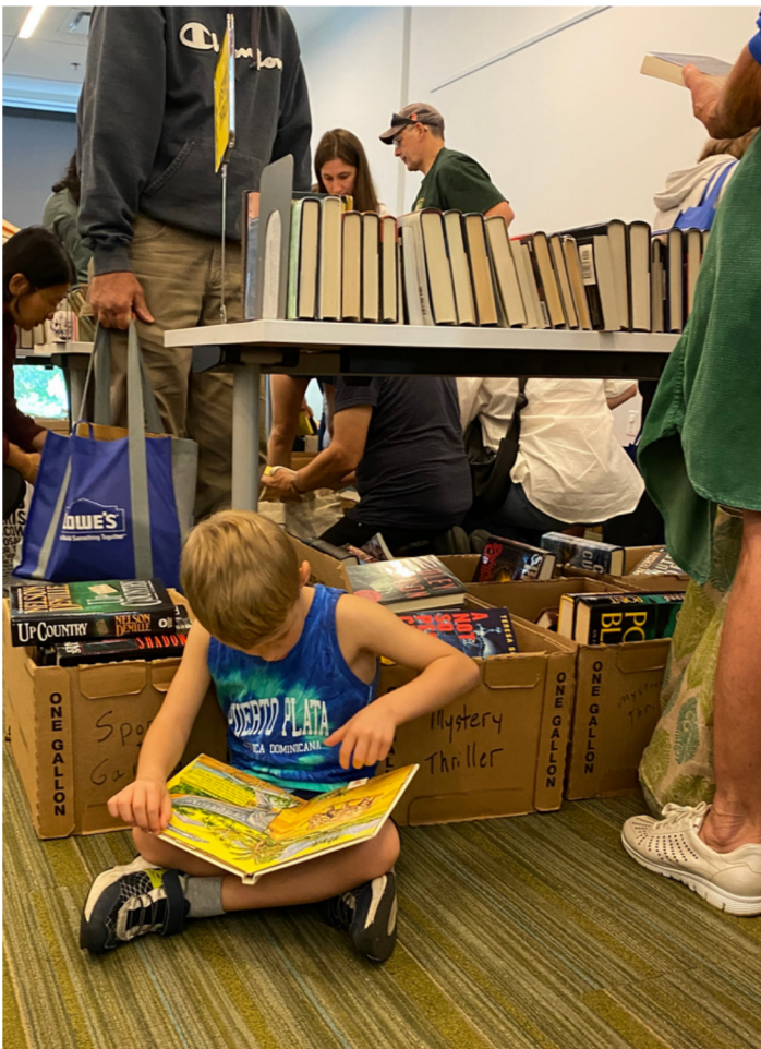
Underfoot? Never. This young boy found a quiet spot to read his book about dinosaurs in the midst of the hectic first hours of the recent June book sale.